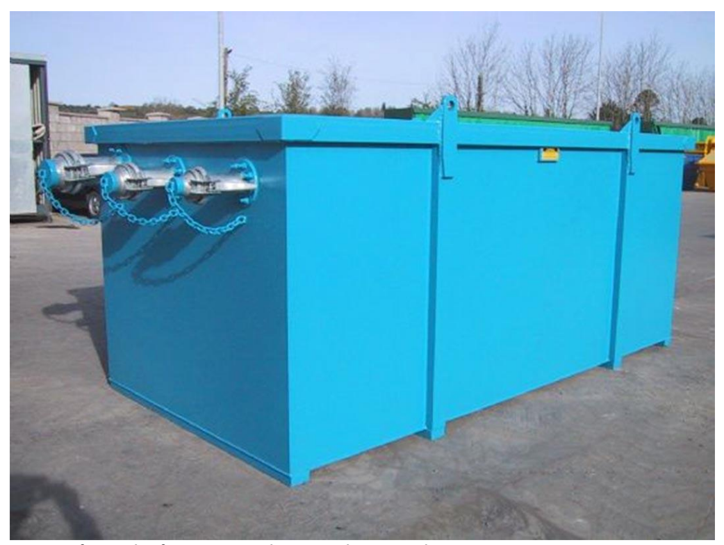
Figure 3.2f Example of Temporary Sediment Settlement Tank