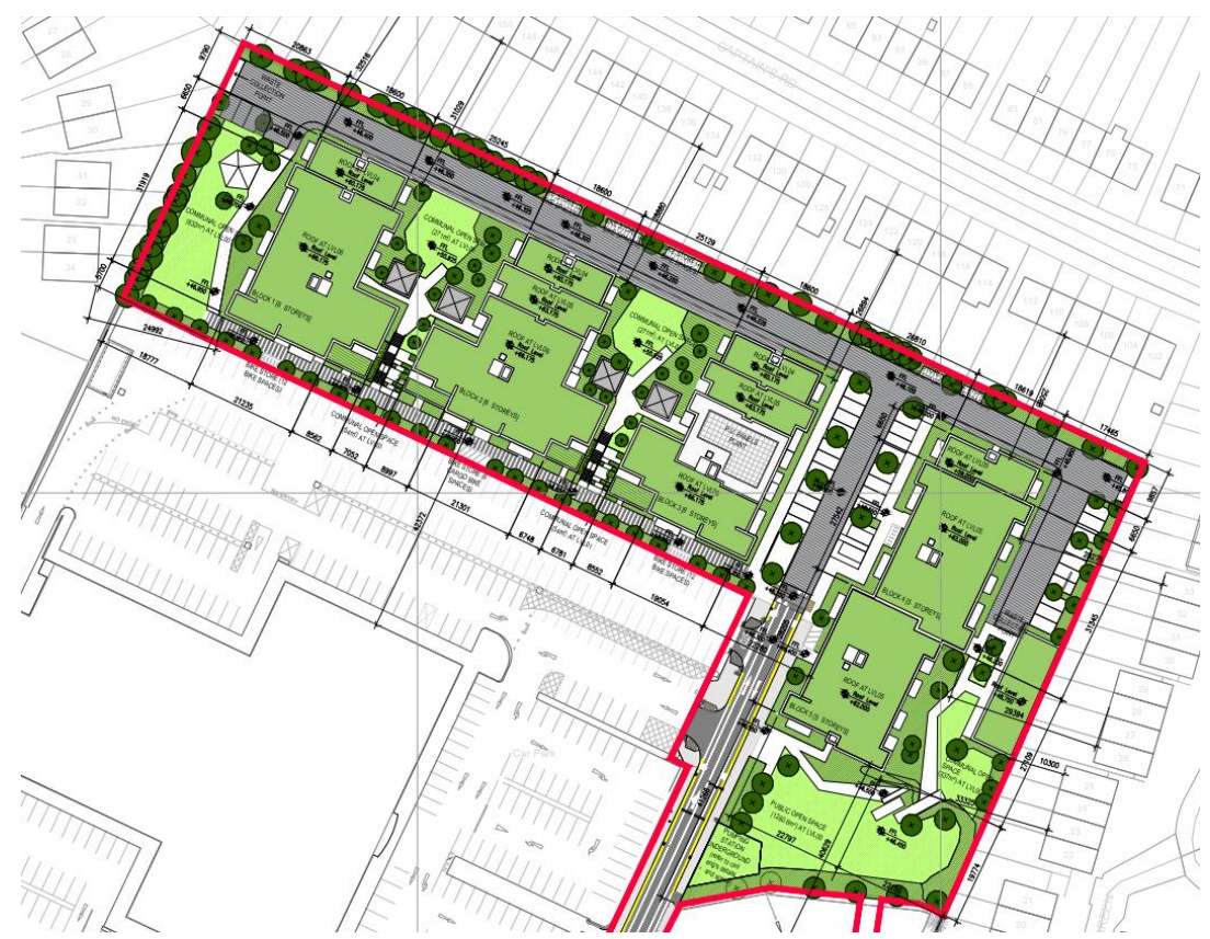
Figure 1.1b Architects Site Layout