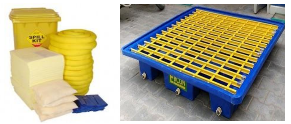
Figure 3.2c - Examples of chemical spill kit and oil spill drip tray

4. On site fuel storage should be avoided if possible. However, if fuel storage is proposed to take place on site, then as a minimum the Main Contractor shall provide, operate and maintain, a proprietary self-contained and 110% self-bunded fuel store system such as that indicated in the image below (Figure 3.2d), complete with pump, dispensing hose, removable fuel particle filter, automatic shut off trigger. Fuelling should only be undertaken in designated areas with spill control measures in place.