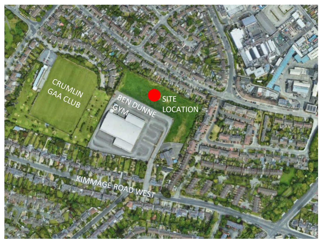
Figure 1.1a Site Location

The River Poddle lies approximately 300m to the east of the subject site, running parallel to the eastern boundary. The site is currently green space (with trees / shrubs) with no existing structures. Refer Figure 1.1a for aerial view of the site. Refer to Architects schematic layout in Figure 1.1b.