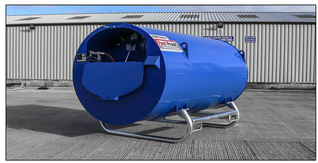
Figure 3.2d Example of Self Bunded Fuel Tank

4. On site fuel storage should be avoided if possible. However, if fuel storage is proposed to take place on site, then as a minimum the Main Contractor shall provide, operate and maintain, a proprietary self-contained and 110% self-bunded fuel store system such as that indicated in the image below (Figure 3.2d), complete with pump, dispensing hose, removable fuel particle filter, automatic shut off trigger. Fuelling should only be undertaken in designated areas with spill control measures in place.