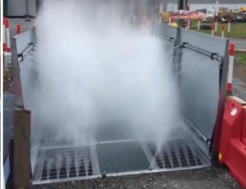
Figure 3.2e Example of static wheel wash systems