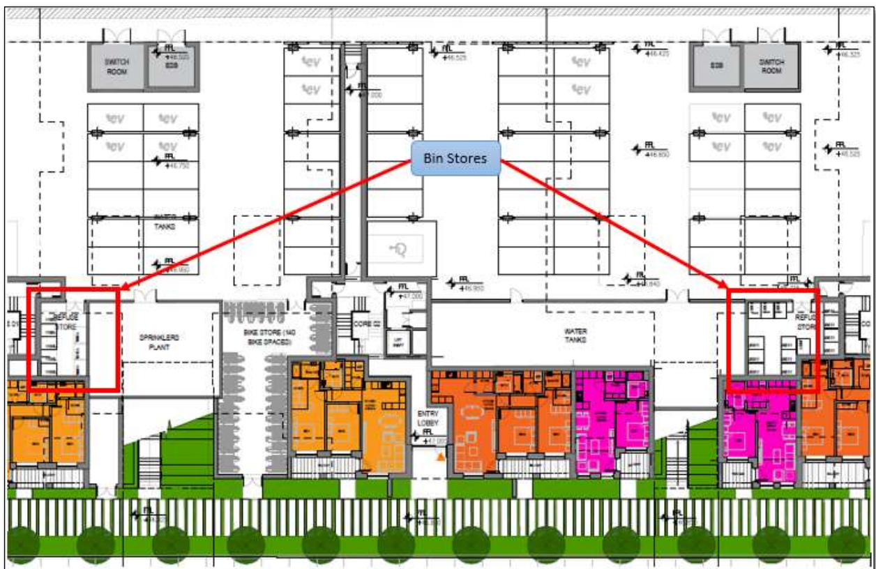
Figure 2.0 Waste Storage Areas

On collection day, the bins will be brought from the bin store up to the waste collection point by the management company personnel. Once the bins are emptied the bins will be brought back down to the waste storage area.