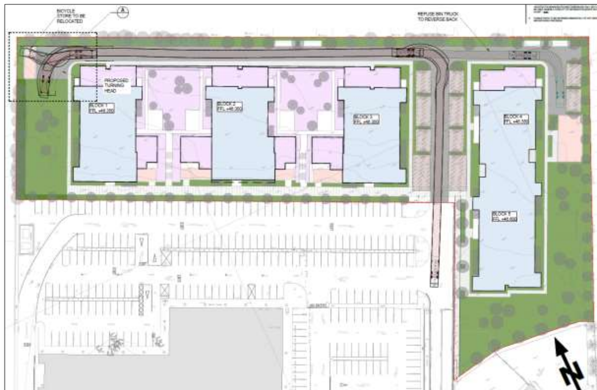
Figure 5.0 Refuse Bin Truck Auto Turn Plan