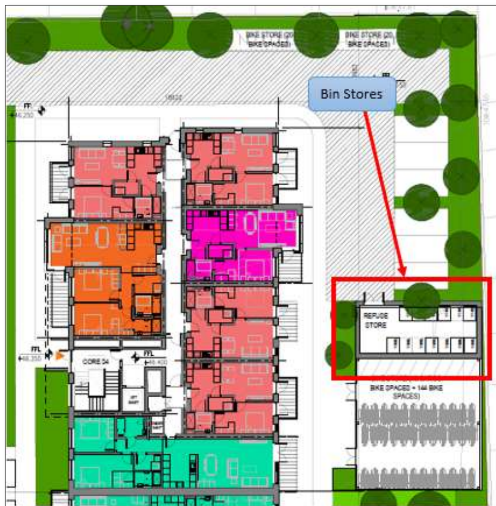
Figure 4.0 Waste Storage Areas

On collection day, the bins will be brought from the bin store up to the waste collection point by the management company personnel. Once the bins are emptied the bins will be brought back down to the waste storage area.