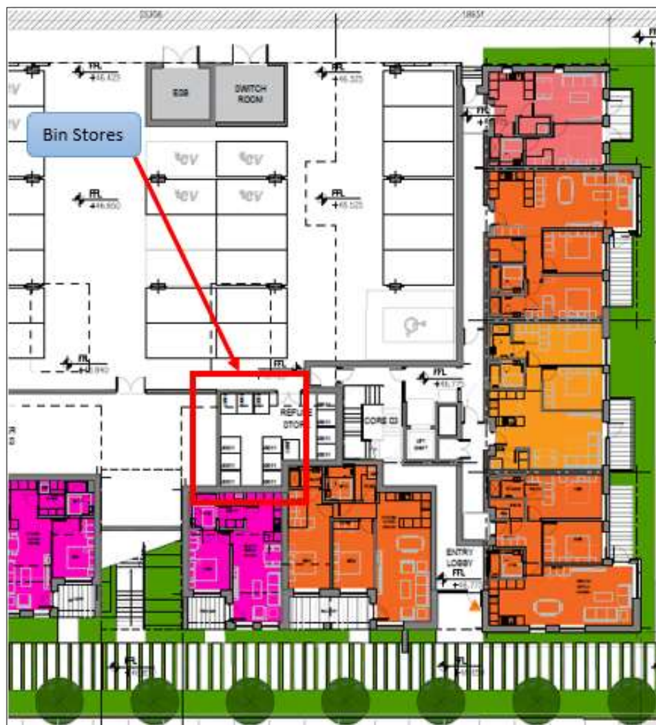
Figure 3.0 Waste Storage Areas

On collection day, the bins will be brought from the bin store up to the waste collection point by the management company personnel. Once the bins are emptied the bins will be brought back down to the waste storage area.